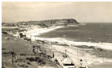
Circa 1950 Merewether Beach

“Merewether has one of the finest natural beaches in the Commonwealth with modern dressing and shelter sheds and promenades. Recently constructed by the Council is a fine bathing pool the natural rocks which abound the beach on the southern end.